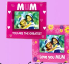
Assorted Glass Photo Frames