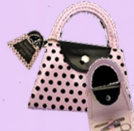
Handbag Manicure Set