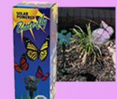
Solar Powered Butterfly