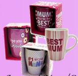
Assorted Mum/Granma mugs