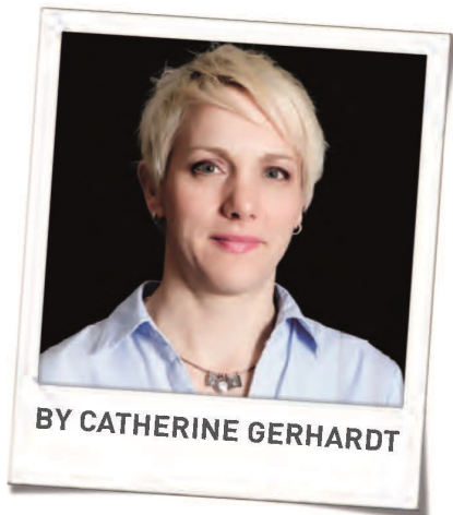
BY CATHERINE GERHARDT